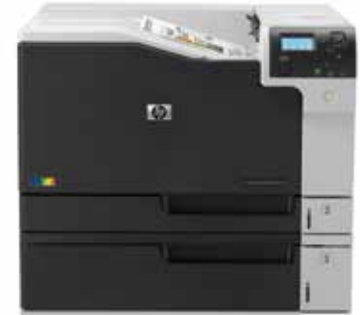
HP Color LaserJet Enterprise M750n

Mobile printing capability: 10 HP ePrint, Apple AirPrint™