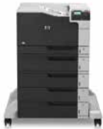
HP Color LaserJet Enterprise M750dn