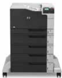
HP Color LaserJet Enterprise M750xh