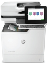
HP Color LaserJet Enterprise Flow MFP M681f