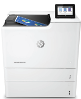
HP Color LaserJet Enterprise M653x