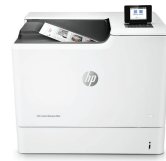
HP Color LaserJet Enterprise M652dn