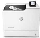
HP Color LaserJet Enterprise M652n