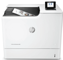
HP Color LaserJet Enterprise M652dn