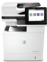
HP LaserJet Enterprise MFP M633fh

This HP LaserJet MFP with JetIntelligence combines exceptional performance and energy efficiency with professional-quality documents right when you need them—all while protecting your network from attacks with the industry's deepest security. 1