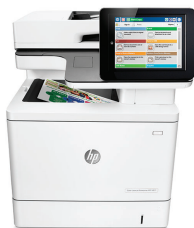
HP Color LaserJet Enterprise MFP M577dn

Ideal for enterprises and medium businesses that need a secure, highly productive, energy-efficient color MFP.