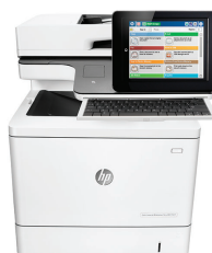
HP Color LaserJet Enterprise Flow MFP M577c