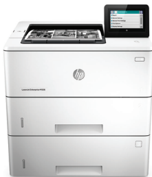
HP LaserJet Enterprise M506x