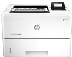
HP LaserJet Enterprise M506dn