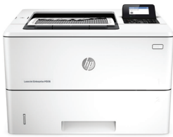
HP LaserJet Enterprise M506n

Finish key tasks faster with a printer that starts right away and helps conserve energy. 1 Multi-level device security helps protect from threats. Original HP Toner cartridges with JetIntelligence and this printer produce more high-quality pages. 2