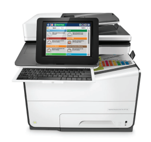
HP PageWide Enterprise Color Flow MFP