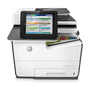
HP PageWide Enterprise Color MFP 586dn

Ultimate value for today's enterprise—HP PageWide Technology delivers the fastest speeds and deepest security for the lowest total cost of ownership in its class. Power productivity with seamless workflow features.