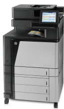
HP Color LaserJet Enterprise flow M880z Multifunction Printer

This top-of-the-line enterprise MFP helps streamline workflows and accelerate document tasks—with advanced finishing options and file sharing. Give users simple, direct access to this MFP through mobile printing and touch-to-print capabilities. 6