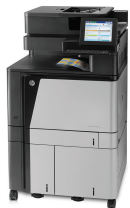
HP Color LaserJet Enterprise flow M880z+ NFC/Wireless Direct MFP Printer