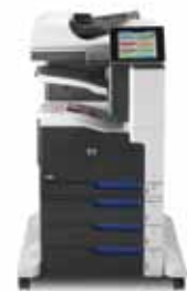
(HP LaserJet Enterprise 700 Printer M775z)