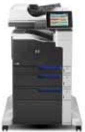
(HP LaserJet Enterprise 700 Printer M775f)