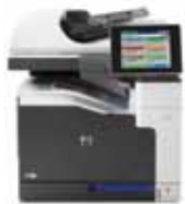
(HP LaserJet Enterprise 700 Printer M775dn)