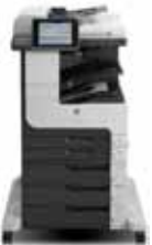
HP LaserJet Enterprise MFP M725z