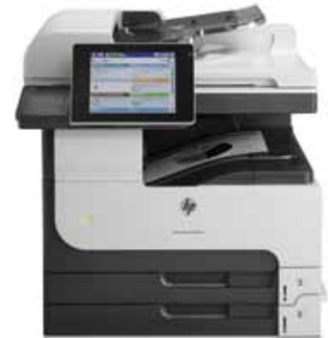
(HP LaserJet Enterprise MFP M725dn shown)

Mobile printing capability: HP ePrint, Apple AirPrint ™