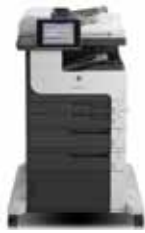
HP LaserJet Enterprise MFP M725f