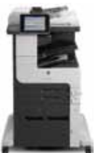
HP LaserJet Enterprise MFP M725z+